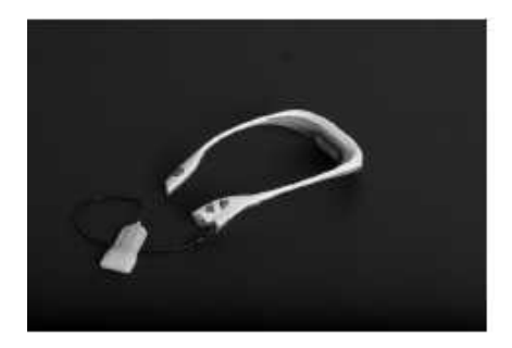
Figure 4: Design of PoNS™ 4.0