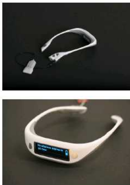
Figure 4: Design of PoNS™ 4.0

Based on market research we have performed to date, we believe we have completed the technical and product design phases of the PoNS™ 4.0 device. While we expect to continue to enhance the PoNS™ 4.0 device design, we are now commencing efforts to complete the manufacturing development phase which will enable us to manufacture the device commercially. We anticipate performing the registrational clinical trials for FDA and Health Canada clearance with the PoNS™ 4.0 device for use in treating balance disorder in mild to moderate TBI subjects and MS subjects. While we expect the PoNS™ 4.0 commercial device to deliver the same level of stimulation to the patient as the PoNS™ 2.2 laboratory device, we are designing the PoNS™ 4.0 device to be more ergonomic for better patient comfort, more hygienic (including a replaceable mouthpiece), more technologically advanced (including a data logging feature) and more feature laden than its predecessor. The proposed additional functionality of data logging and data communications for the PoNS™ version 4.0 device addresses certain stakeholder needs, such as providing useful information like time remaining during therapy and ready status of the device (e.g. charge level). We also expect to produce the PoNS™ 4.0 device in accordance with FDA’s Quality System Regulation, or QSR, including good manufacturing practices, or GMPs, as well as in accordance with Canadian regulatory requirements.