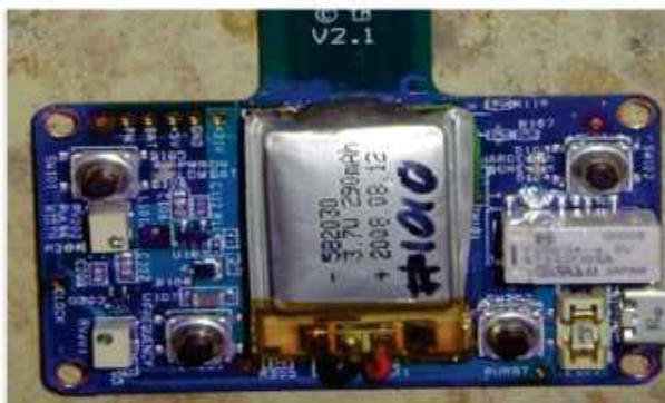
Figure 1: Top of the PoNS™ Neuro-stimulator board

The PoNS™ version 2.2 device is an electrical pulse generator that delivers controlled electrical stimulation to the tongue. Pulses are generated and controlled by commercially available counter, timer, and wave-shaping electronic components. The components are mounted to a single printed circuit board (Figure 1 and Figure 2). The circuit board contains 143 gold-plated electrodes that contact the tongue. A rechargeable lithium- polymer battery with built-in charge safety circuitry provides power.