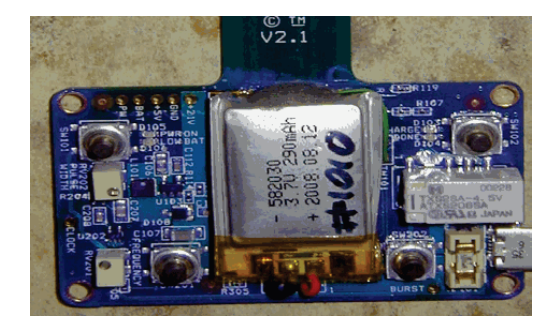
Figure 1: Top of the PoNS Neuro-stimulator board

The portable neuromodulation stimulator (PoNS(TM)) version 2.2 device is an electrical pulse generator that delivers controlled electrical stimulation to the tongue. Pulses are generated and controlled by commercially available counter, timer, and wave-shaping electronic components. The components are mounted to a single printed circuit board (Figure 1 and Figure 2). The circuit board contains 143 gold-plated electrodes that contact the tongue. A rechargeable lithium-polymer battery with built-in charge safety circuitry provides power.